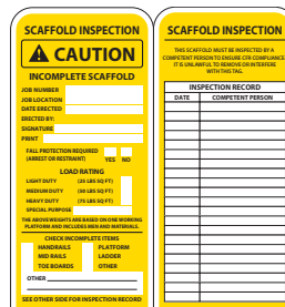
RPT226* 25/pack 7 5/8" x 3 1/4" flexible plastic tags