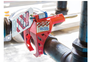
Ball Valve Lockouts KDD442* For 3/8" - 1-1/4" valve