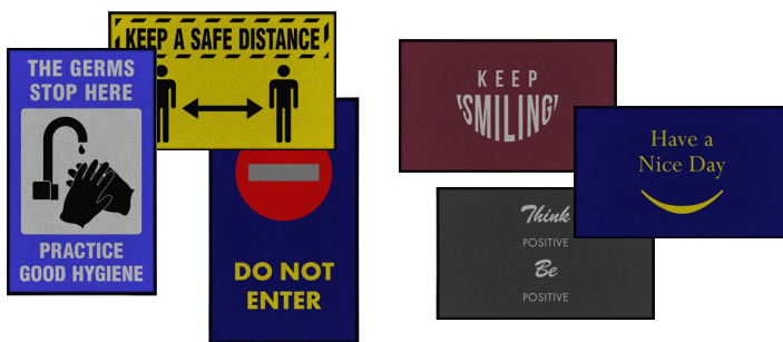
194 Message Mats