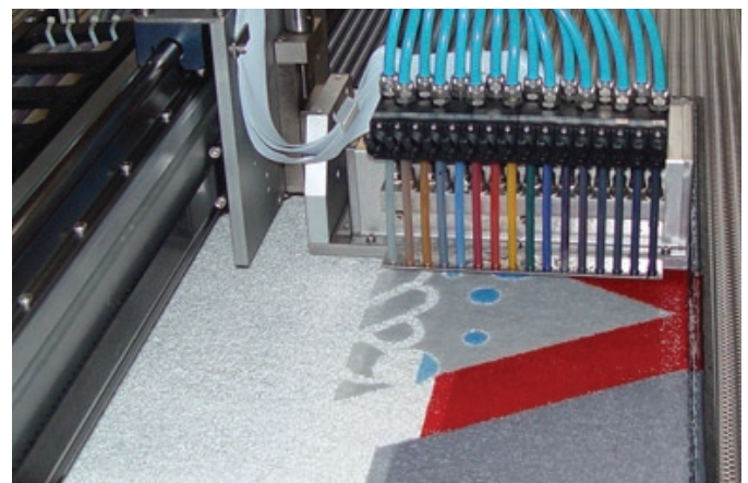
195 Slogan Mats

Print process injects dye deep into the pile to keep color from fading.