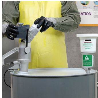
Aerosol Can Recycling