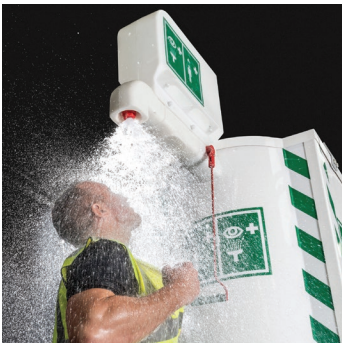
Emergency Eye/Face Wash & Safety Showers