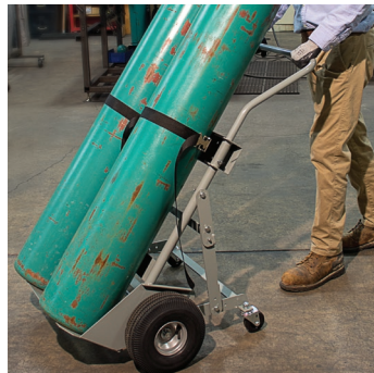
Gas Cylinder Handling