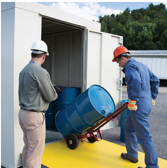
Outdoor Storage Lockers