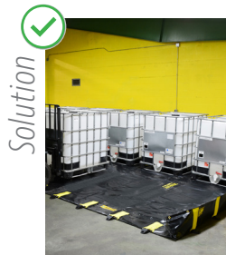
Solution Use compliant containment solutions