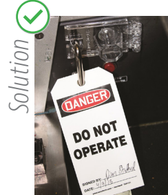
Solution Use lockout/tagout solutions