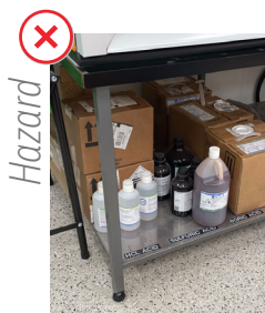
Hazard Improper storage