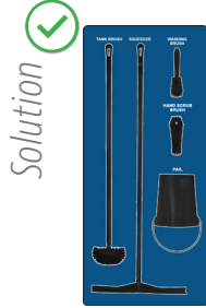
Solution Use a Store-Board™ shadow board