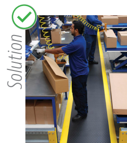
Solution Use proper floor matting