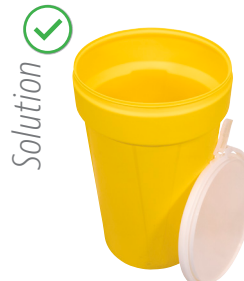
Solution Use FDA-compliant poly drums