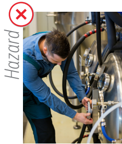
Hazard Possible accidental start up