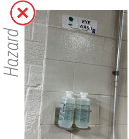
Hazard No Continual flow— not ANSI compliant