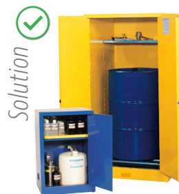
Solution Use compliant storage solutions