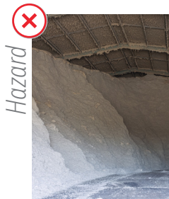
Hazard Food-grade storage