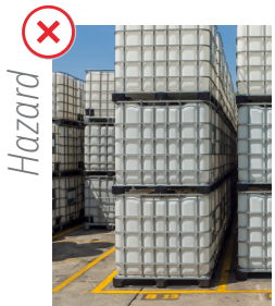
Hazard No secondary containment