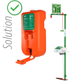
Solution Use a compliant shower and/or eye wash