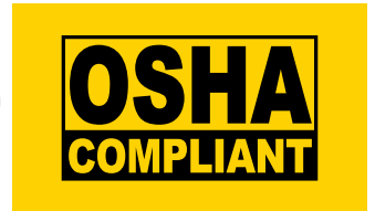
Recommended by OSHA as an important safety precaution