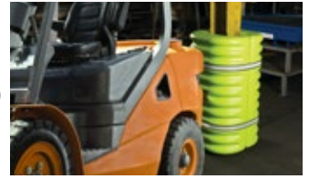
Absorbs forklift and tow-motor impacts