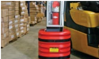
Aids in ADA compliance, Mini – 24" height column protectors fit under fire extinguishers