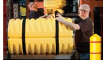
Hassle-free set-up, no tools required