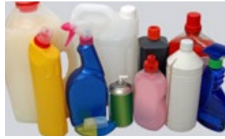
Resistant to most chemicals