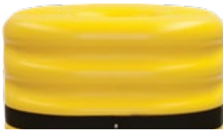
Heavy Duty blow-molded 100% high-density polyethylene (HDPE)