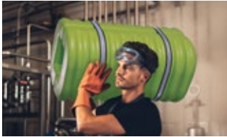
Lightweight for ease of transport