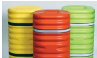
Safety Orange, Yellow, Red, Lime Green for high visibility