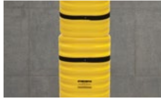
Stackable for added protection