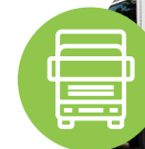
Fire Engines/Trucks Heavy Duty Wheel Chocks