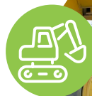
Haul Trucks, Loaders, Cranes Heavy Duty Wheel Chocks