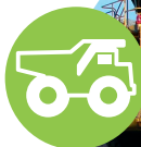
Heavy Equipment Heavy Duty Wheel Chocks