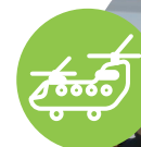
Military Aircraft Aviation Wheel Chocks