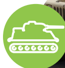
Military Vehicles Heavy Duty Wheel Chocks