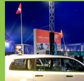
General-Purpose Non-Lighted Whips