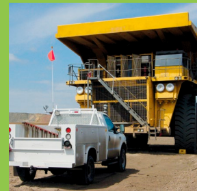
General-Purpose Lighted Whips