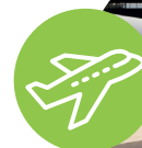
Private/Commercial Aviation Aviation Wheel Chocks