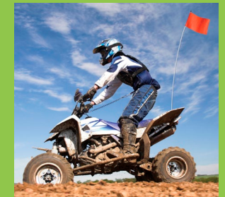
Light-Duty Warning Whips