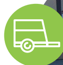
Over the Road Trucks, Trailers, Pickups General Purpose Wheel Chocks