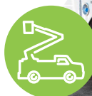
Utility Vehicles General Purpose Wheel Chocks