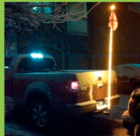
All-Purpose Waterproof Lighted Whips