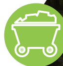
Underground Mining Vehicles Heavy Duty Wheel Chocks