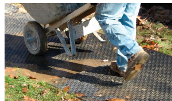
Create safe walking paths and temporary sidewalks