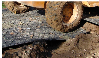
Add stability and traction in unstable or harsh conditions