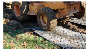
Lasts longer than plywood—won't warp, splinter or break

(800) 798-9250 • custserv@justrite.com • Checkers-Safety.com